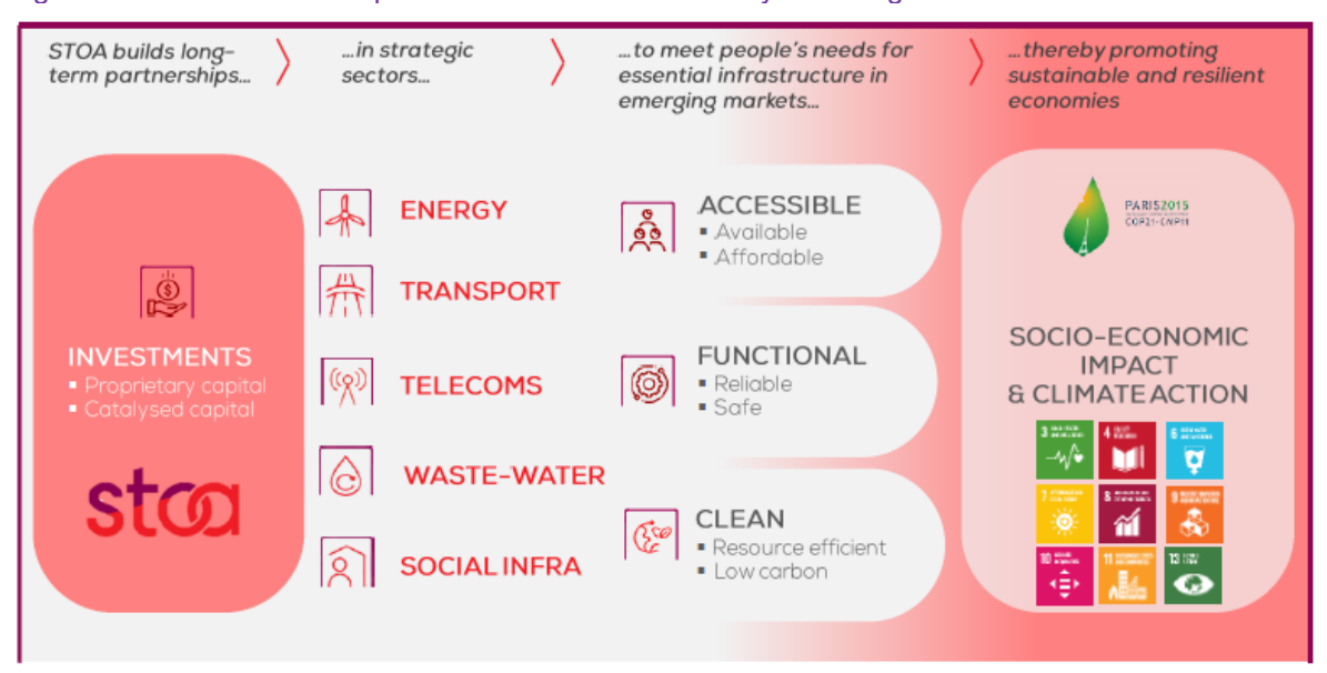
Exhibit 1: The Theory of Change

The impact statement is closely bound to the underlying Theory of Change, which represents the different pathways through which STOA's interventions lead to impact results. Exhibit 1 reads from left to right and shows STOA's impact statement and the Theory of Change.